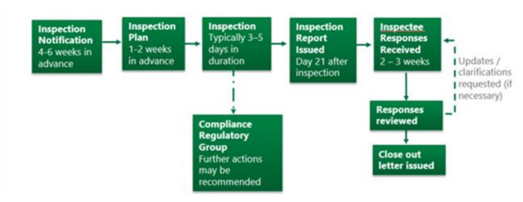
Figure 2: Routine national GCP inspection process

HPRA Guide to Clinical Trials conducted under the Clinical Trials Regulations (CTR) in Ireland